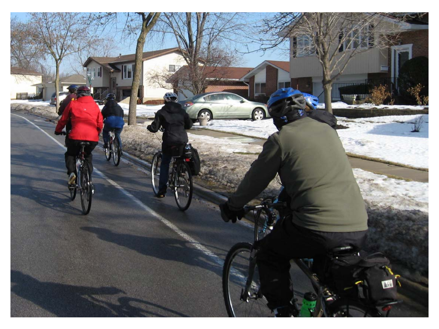
When the bike paths and trails are snow covered during the winter, the bike lanes around Schaumburg are open.