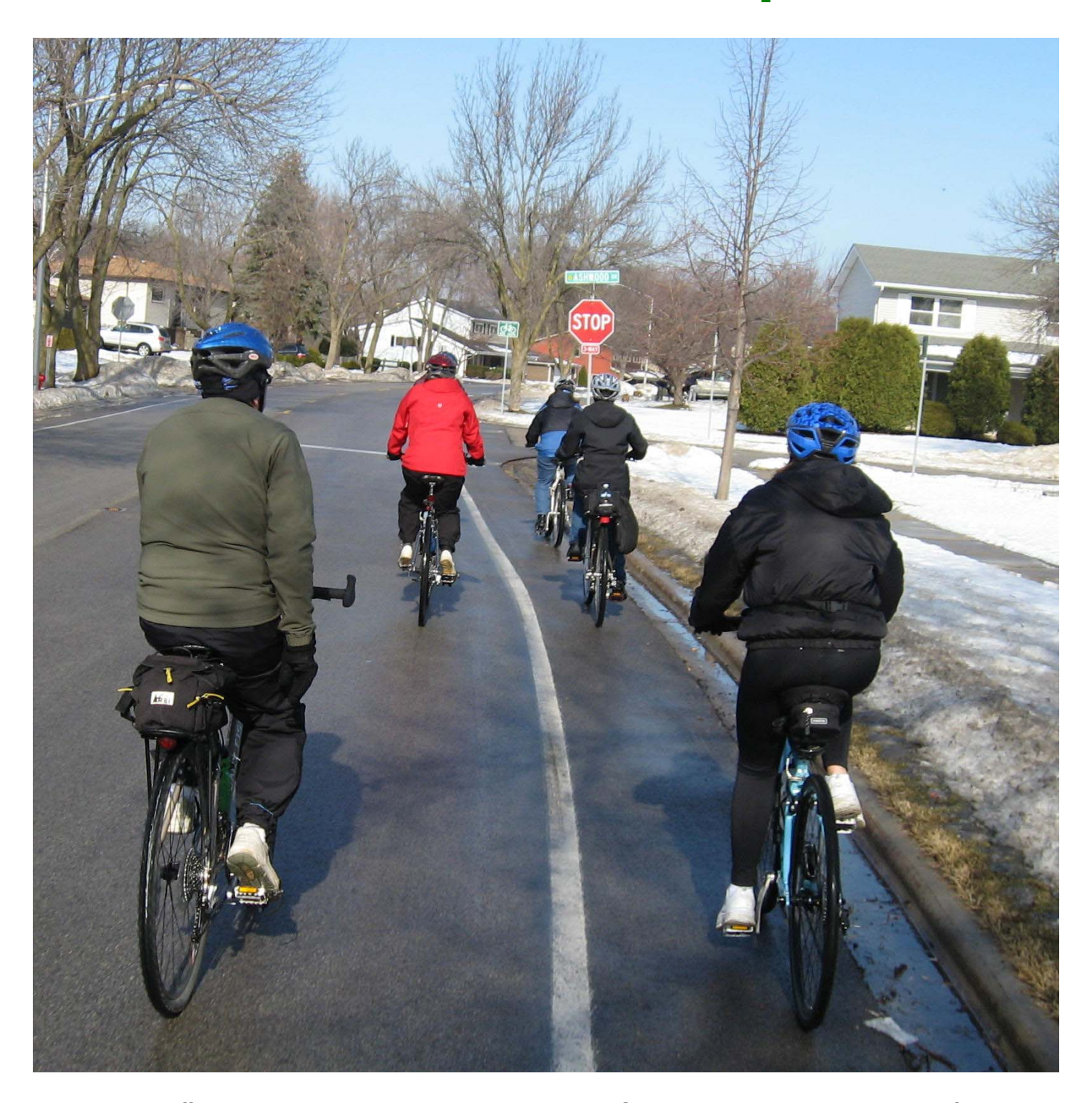
The low traffic on the side streets (bike routes) around Schaumburg creates a very bike friendly environment.