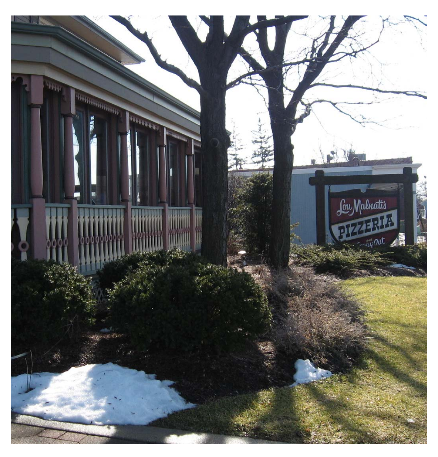
Our bike group ends up at Lou's for some Pizza!